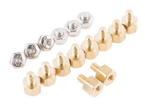
Intel Edison Hardware Pack