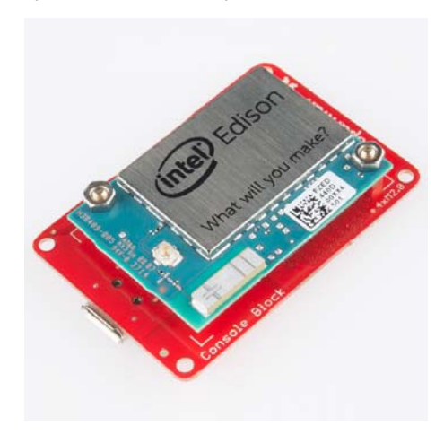
Console Block Installed

To use the console Block, attach an Intel Edison to the back of the board, or add it to your current stack. Blocks can be stacked without hardware, but it leaves the expansion connectors unprotected from mechanical stress.