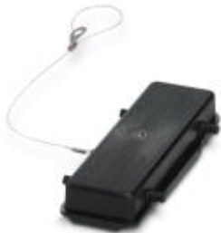
HEAVYCON protective cover, B24, for HC-EVO-B24... supporting base element, for double locking latch, with retaining cord with combination eyelet, IP54

Please be informed that the data shown in this PDF Document is generated from our Online Catalog. Please find the complete data in the user's documentation. Our General Terms of Use for Downloads are valid ( http://phoenixcontact.com/download )